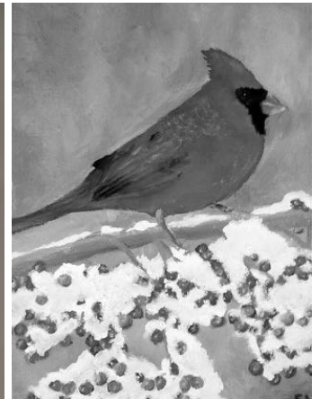
The Annual Young Artists Showcase will highlight art from a wide variety of media and includes submissions from students from Pre-K to high school.

Have you ever been to First Fridays in Bel Air? How about a Summer Movie Night? You have, without a doubt, heard about the Maryland State BBQ Bash. The Bel Air Downtown Alliance, in partnership with the Town of Bel Air, organizes these, and many other events.