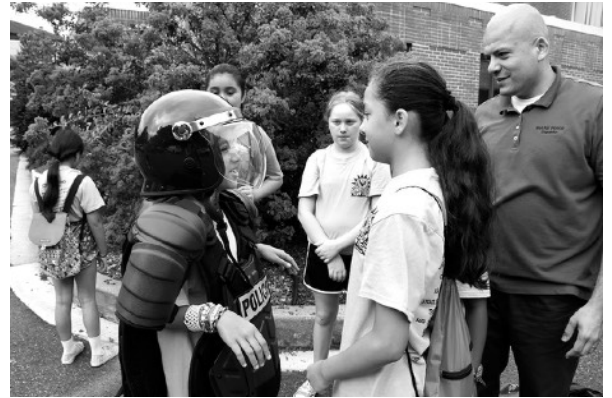
For the ninth year in a row, children from the LASOS, Inc. summer camp visited the Bel Air Police Department.

It’s important for us to represent everybody in the community. My message is that whether you are the wealthiest person in the world or a homeless person, everybody’s treated equally and fairly within the Town of Bel Air.