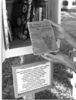
The Sedney library on Gordon Street includes vintage books from Frances Sedney’s personal collection.