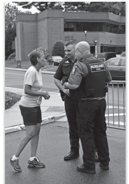
The auxiliary police force is on hand at all major events such as the Bel Air Town Run.