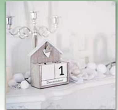
It's not too soon to mark your calendar for holiday events. P. 5