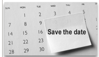
CALENDAR OF EVENTS PAGE 6 - 8