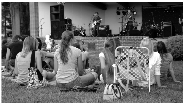
Warm weather is on its way. Check calendar on pages 6 - 8 for upcoming and free concerts in town.

Now that the winter is, hopefully, behind us, we can all begin to look forward to Spring 2015. As always, the Town will buzz with all kinds of activity. One of our mainstays, Bel Air's Farmer's Market , will celebrate its 40 th year in bringing freshly picked and harvested goods from farm to table. Congratulations to all those involved.