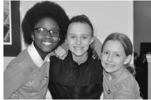
A YOUNG NONPROFIT MAKES A DIFFERENCE PAGE 4