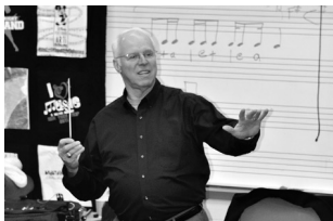
HAVE YOU HEARD THE BEL AIR COMMUNITY BAND? PAGE 9