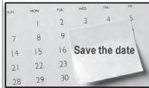
CALENDAR OF EVENTS PAGE 6 - 8