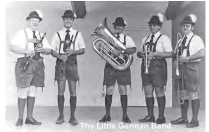
The Little German Band