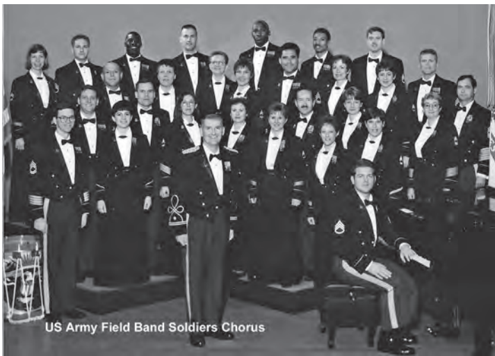
US Army Field Band Soldiers Chorus