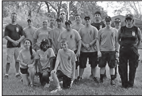
Bel Air Police Explorer Post 9010 members helped with the Bel Air Town Run on June 7th.

Of course it wouldn't be summertime in Bel Air if I didn't mention the many events that make Bel Air the very special place that we have all come to know and love. The Summer Concert Series and the Outdoor Movies will again enliven Shamrock Park. No other Town celebrates Independence Day like Bel Air, with a day full of family events, culminating with a patriotic parade on Main Street and a fireworks display that everyone anxiously awaits each and every year. There will be the BBQ Bash in August. We will close out the summer with the 50 th anniversary of the Festival for the Arts.