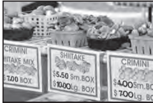
FORTY YEARS OF FRESH & LOCAL AT FARMERS MARKET PAGE 9