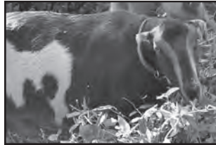
YES, THOSE ARE GOATS AT ROCKFIELD MANOR PAGE 10