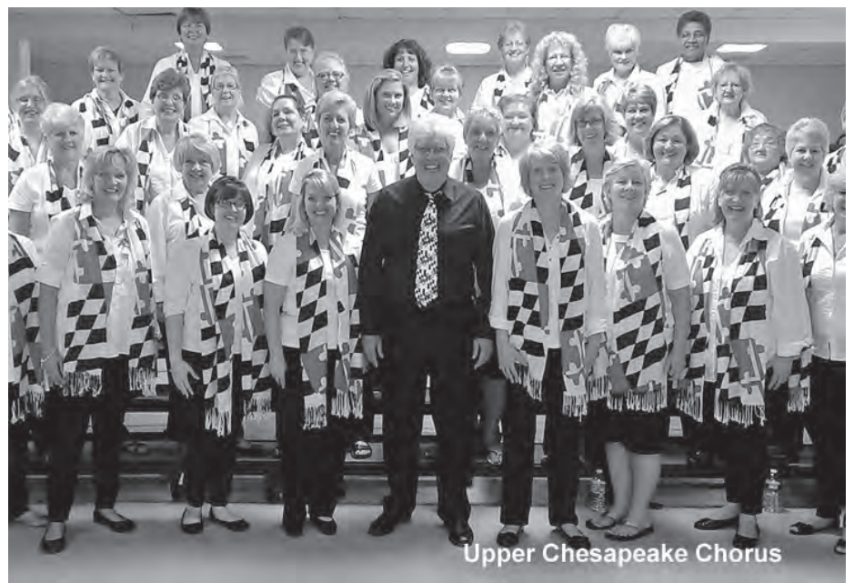
Upper Chesapeake Chorus