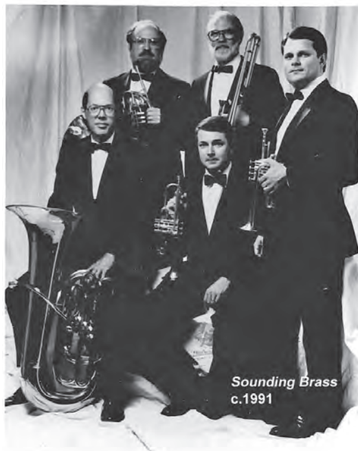
Sounding Brass c.1991