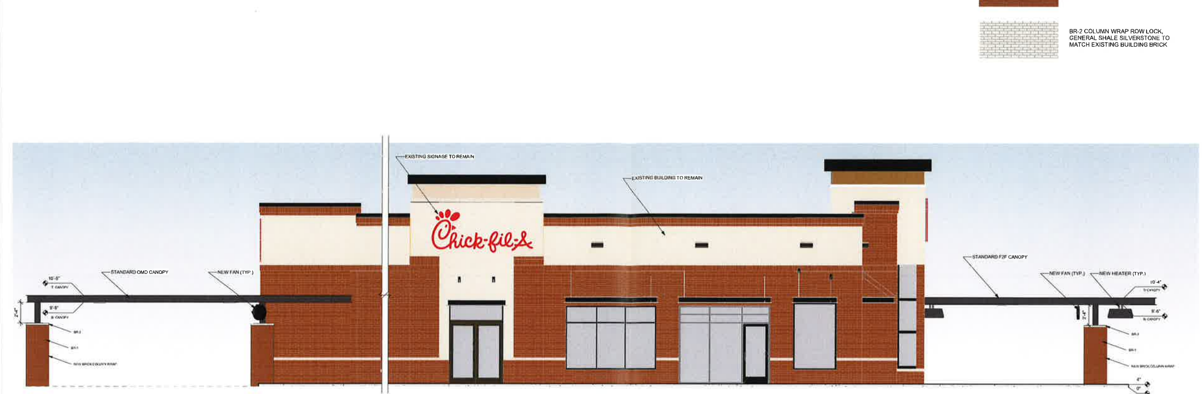
1 SOUTH ELEVATION 1/4" = 1'-0"

BR-1 COLUMN WRAP, GENERAL SHALE RED VELOUR TO MATCH EXISTING BUILDING BRICK BR-2 COLUMN WRAP ROW LOCK, GENERAL SHALE SILVERSTONE TO MATCH EXISTING BUILDING BRICK