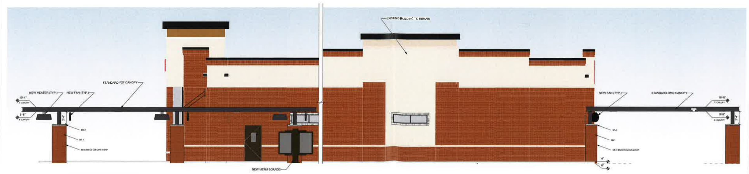
2 NORTH ELEVATION 1/4" = 1'-0"

1/2" = 1'-0" (VERTICAL SCALE) 1/4" = 1'-0" (HORIZONTAL SCALE) 1/8" = 1'-0" (HORIZONTAL SCALE) 1/16" = 1'-0" (HORIZONTAL SCALE)