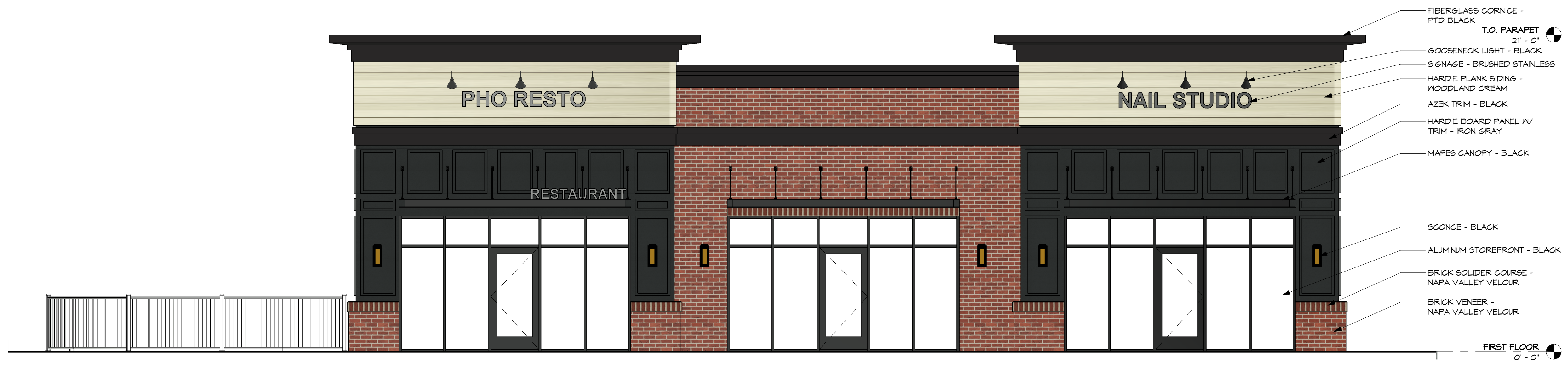
1 FRONT ELEVATION 02.0 1/4" = 1'-0"