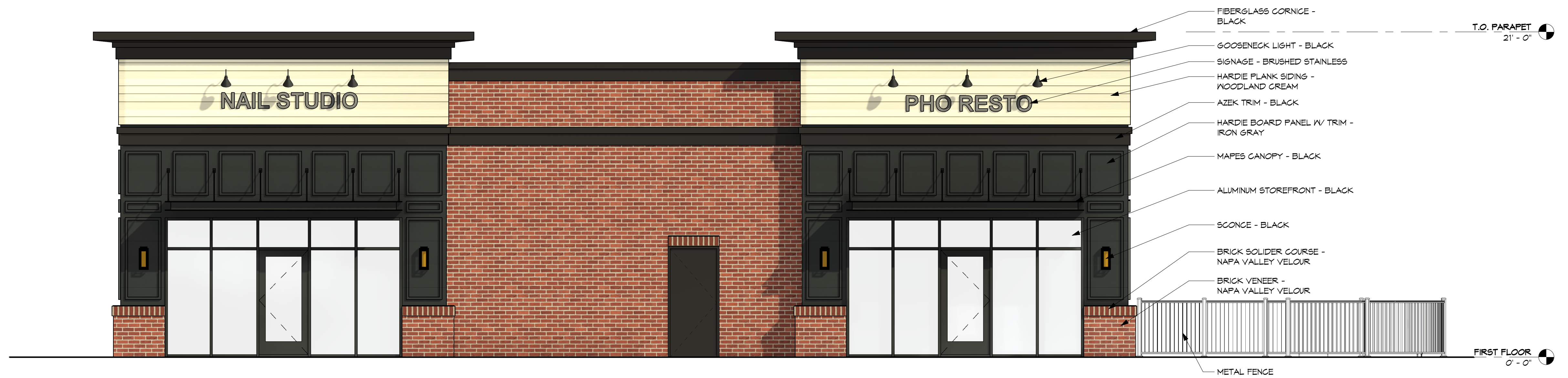
1 02.1 BACK ELEVATION 1/4" = 1'-0"