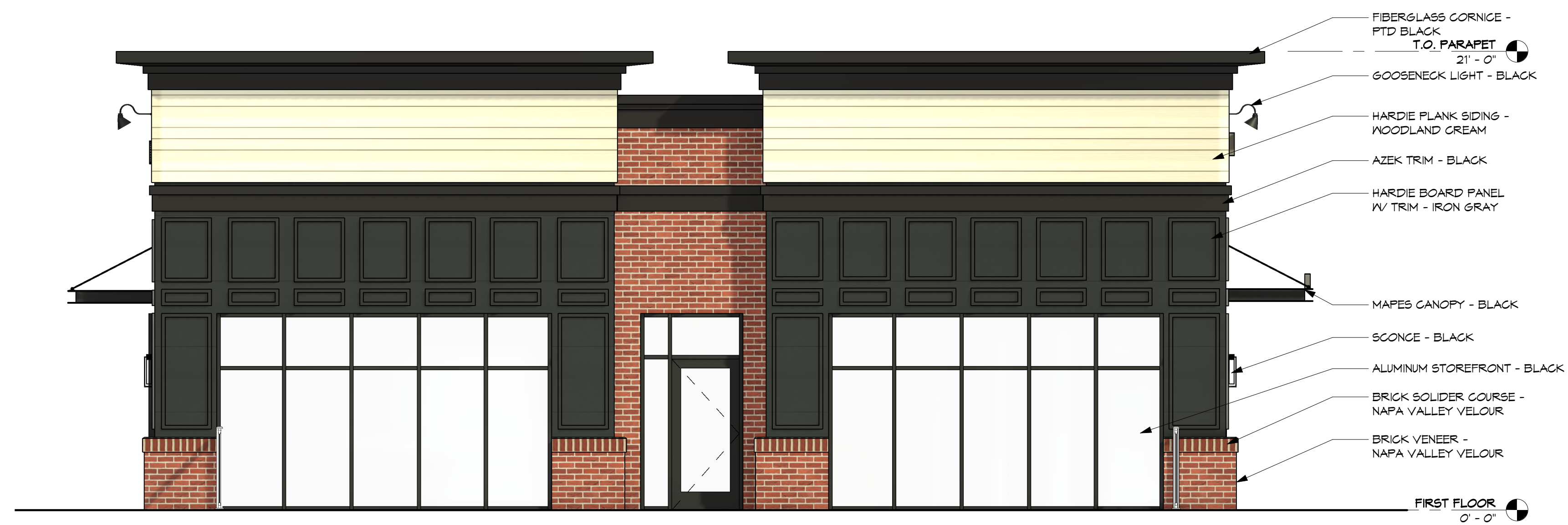
2 LEFT ELEVATION 02.0 1/4" = 1'-0"