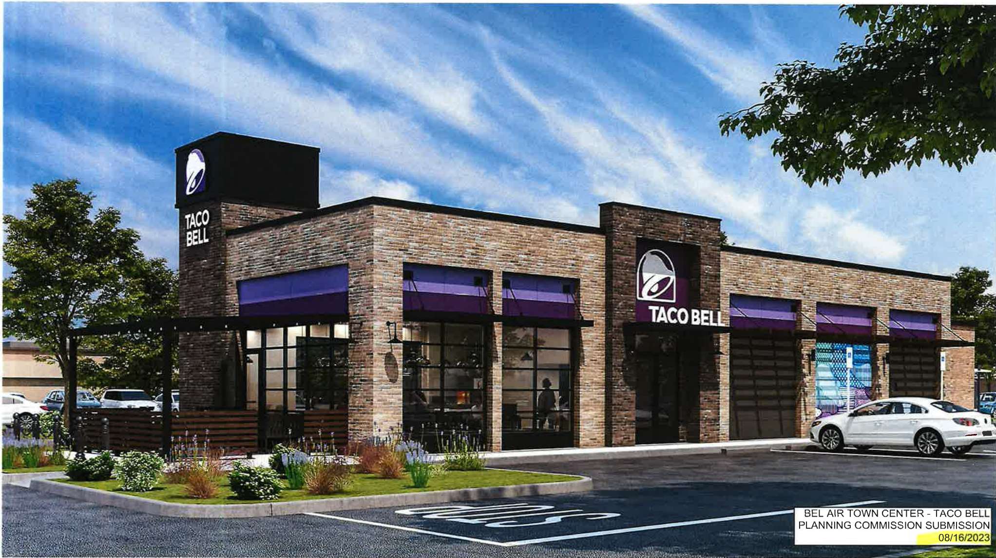
BEL AIR TOWN CENTER - TACO BELL PLANNING COMMISSION SUBMISSION 08/16/2023